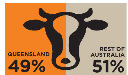
PERCENTAGE OF AUSTRALIA'S TOTAL BEEF HERD